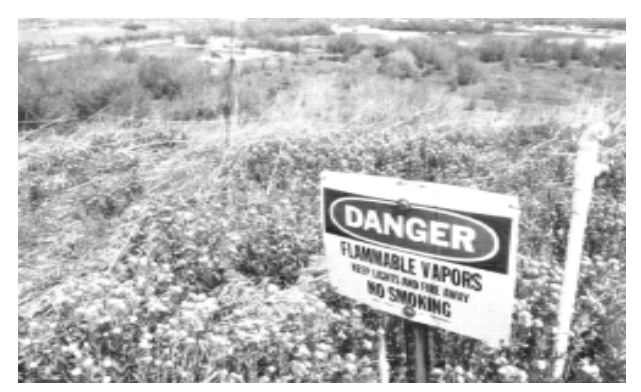
THE ULTIMATE POST-INDUSTRIAL LANDSCAPE?

Last June, The Chicago Reader, a local weekly, ran a photograph of a warning posted in an apparently empty wetland. It read: